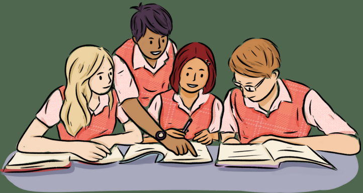
Connection to Community Resources