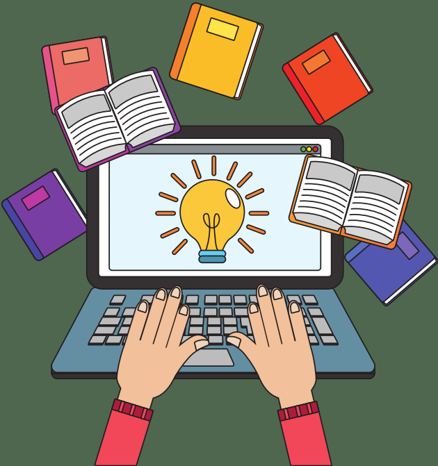
Education of Community Resources